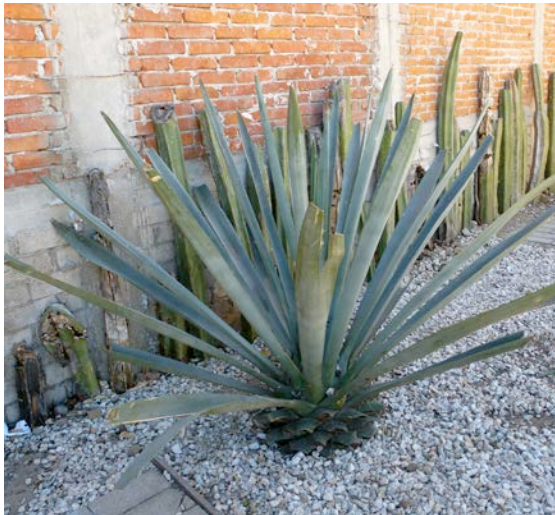
An agave plant used for making mescal in Oaxaca (not the blue agave variety)

dancers (deer dancers) during certain religious ceremonies, suggesting the prominence and importance of deer in those cultures. Hunted less commonly were pronghorn and javelina. Predators have rarely, if ever, been hunted for meat (e.g. mountain lion, jaguar, ocelot, black bear, coyote, gray wolf, and foxes). In addition to large quantities of fish and shellfish (and some sea lion), the Seri People also used to eat pelicans seasonally. However, sea turtles were their primary source of protein.