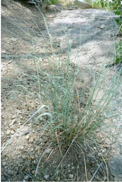
Sideoats grama ( Bouteloua curtipendula )

dancers (deer dancers) during certain religious ceremonies, suggesting the prominence and importance of deer in those cultures. Hunted less commonly were pronghorn and javelina. Predators have rarely, if ever, been hunted for meat (e.g. mountain lion, jaguar, ocelot, black bear, coyote, gray wolf, and foxes). In addition to large quantities of fish and shellfish (and some sea lion), the Seri People also used to eat pelicans seasonally. However, sea turtles were their primary source of protein.