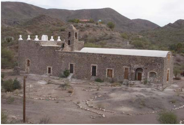
The spartan Jesuit mission at Mulegé, Baja California Sur, built in 1707