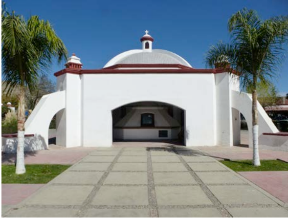
Memorial housing Padre Kino bones, in the zócalo of Magdalena de Kino, Sonora