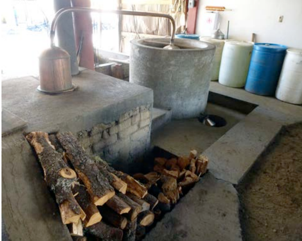
A still used to recover the alcohol from cooked agave