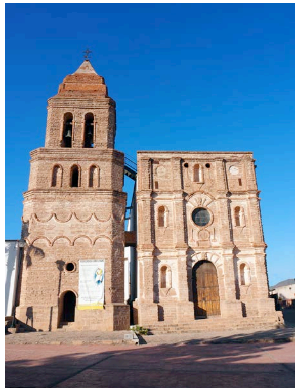
The Jesuit church at Arizpe, founded in 1646 by Jerónimo de la Canal. Once the capital of northern New Spain, it was from Arizpe (Horcasitas) that Juan Bautista de Anza’s expedition to Alta California was launched (in 1775), eventually leading to his establishment of the city of San Francisco. De Anza’s remains are believed to lie in the church at Arizpe (though probably still buried, the exhumed bones likely being from one of De Anza’s soldiers).