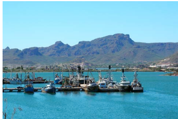
Part of the fishing fleet (sardines and shrimp) at the new dock, outer Guaymas Harbor, Sonora

Guaymas is one of the best natural harbors in all of Mexico. During the 19th century, large Mexican, U.S., and English mercantile firms were established there, and a regularly scheduled steamship line to San Francisco and much of the Pacific Rim developed.