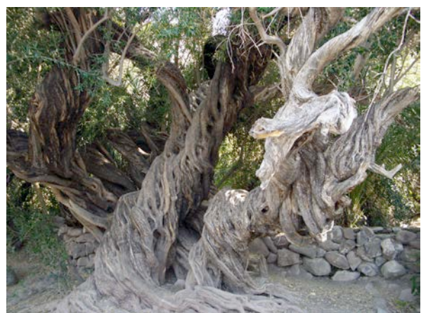
An original mission olive tree, 300 year-old, still living at San Francisco Xavier mission in the Sierra La Giganta, Baja California Sur.