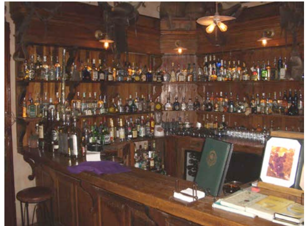
The tequila bar at the Hacienda de los Santos, Álamos, Sonora, offers up ~100 varieties of the liquor. Salud!