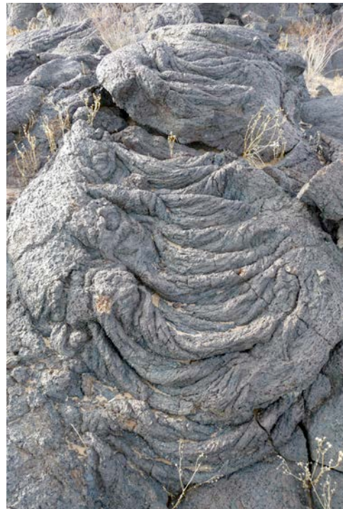
Pillowed pahoehoe lava, Pinacates

The Pinacate area of northwest Sonora is unique for being home to North America's second largest lava flow region (the Snake River Plain basalt fields of Idaho are slightly larger) and its largest active sand dune field, the latter running northwestward from just north of Puerto Peñasco (Sonora) to Yuma (Arizona). The dune field embraces the western slopes of the Sierra Pinacate, and it completely surrounds the isolated granitic Sierra del Rosario (probably the westernmost Basin-and-Range mountain in North America). This 5700 km 2 (2200 mi 2 ) dune field is estimated to have developed during and following the last Glacial Maximum (~20,000 years ago). The dunes were built almost entirely from wind-transported Colorado River deltaic sands piled up over the centuries from prevailing Westerlies. Thus, these dunes are largely the eroded rocks of the Grand Canyon! East of the Pinacates, along Hwy 8 between the town of Sonoyta and the entrance to the Pinacate Biosphere Reserve, is a field of ancient, stabilized dunes. These are much older dunes, perhaps hundreds of thousands of years in age, but their origin is unclear.