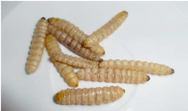
The famous mescal or maguey worm – usually larvae of the cossid moth Comadia redtenbacheri (above), but sometimes a weevil larva ( Scyphophorus acupunctatus ) is used, or the larva of a skipper butterfly ( Aegiale hesperiaris )