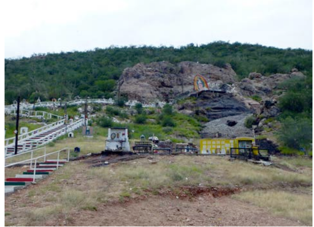
Shrine to the Virgin of Guadalupe, just south of Hermosillo, Sonora

With the mines came merchants, and the Sierra Madre Occidental foothills town of Hidalgo de Parral (in southern Chihuahua) came to be the merchant center for the region, being strategically positioned between the mining areas of Sonora and central Mexico. Most of the silver ore was packed out to Parral where it was assayed and then shipped to Durango or Mexico