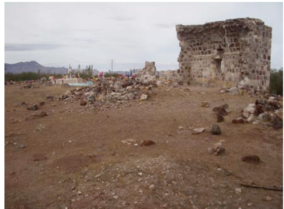
All that remains of the Jesuit mission at Santa Rosalía, Baja California Sur