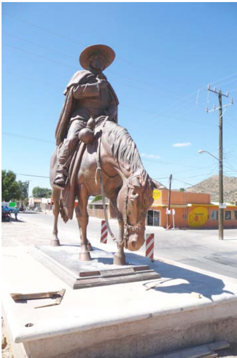
Statue of Padre Kino in the city of Magdalena de Kino, Sonora. In the plaza with statue is a memorial to Kino's remains and a 19 th century church. Built around 1833, the present church does not stand on the site of the original Jesuit church.

Today, one can view the skeletal remains of Padre Kino at the handsome domed crypt in the town of Magdalena de Kino, Sonora, near the church of Santa María Magdalena. Although there is evidence that Kino himself might have established a chapel near this site (perhaps in the 1690s), the existing church dates to 1832 and has been reworked several times.