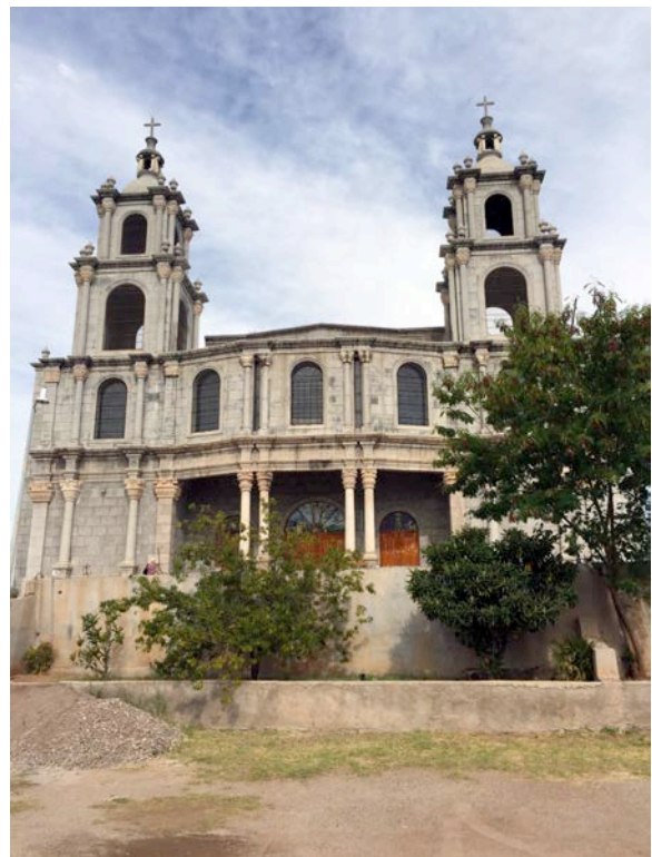
The enigmatic Iglesia de la Virgen de Fatima in Magdalena, Sonora. Built by two brothers who had a vision, or calling. Construction began ~1980 and the church is still not fully finished, although it is functional. In front are two "Kino Heritage Fruit Trees," a peach and a loquat (and a large el Guaje tree on the right, from far to the south).