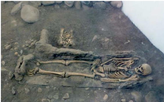
The skeletal remains of Eusebio Kino, in the zócalo of Magdalena de Kino, Sonora

By the end of the 17th Century, the Jesuits had founded 38 primary missions and 59 visitas in Sonora. According to Spanish law, a mission was to be dissolved 10 years after its founding, based on the supposition that by then the natives should be sufficiently versed in Christianity that they could be left on their own. However, the Jesuits had a habit of developing ranching and farming missions that were so economically successful that they tended to forego the 10-year rule. When they were finally