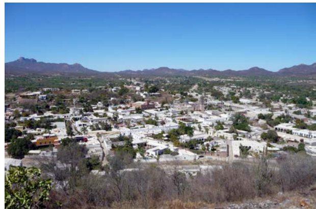
The colonial town of Alamos, Sonora

Apaches may have been due, in part, from differences of sociopolitical thought between Europeans and Indians. European ideas of hierarchy and subordination did not exist among the Apaches, each band having temporary leaders who were not necessarily recognized by the other bands. Thus, a truce made with one group likely did not apply to members of other bands. Farther east, the states of Texas, Coahuila, Nuevo León, and Tamaulipas confronted Comanche raids. Comanche were High Plains bison hunters of Shoshone stock that are said to have been the best riders among all the nomadic tribes of western North America. Some historians have suggested that the position of the present U.S.-Mexico border may have been largely determined by the presence of nomadic Indian bands that stopped and forced back Spanish settlement in southern Arizona and Texas.