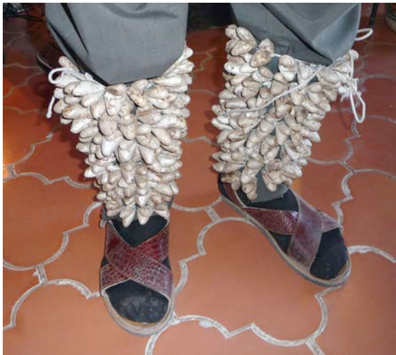
Leg rattles ( ténaborim ) used by Yaqui and Mayo dancers are made from cocoons of the saturniid moth Rothschildia cincta