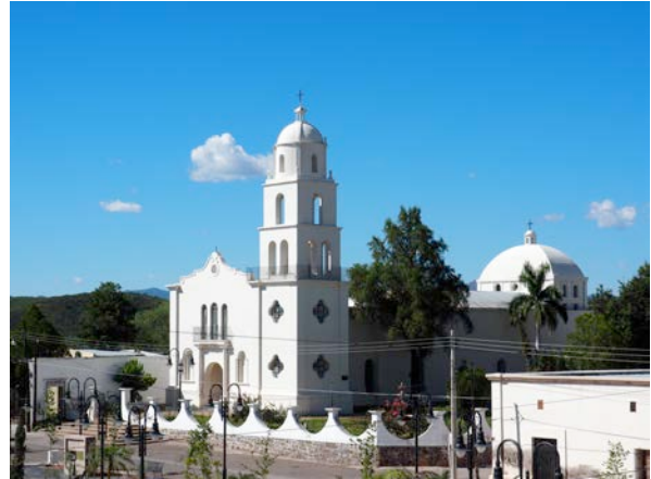
The beautiful church at Banámichi, on the zócalo. Although the mission (and town) was founded by Jesuits in 1639, the present church— Iglesia de Nuestra Señora de Loreto —dates from Franciscan times.