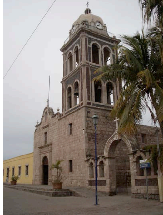
Mission Nuestra Señora de Loreto, the first mission built in the Californias; founded by Padre Juan María de Salvatierra in 1697 and completed in 1752 (Loreto, Baja California Sur)