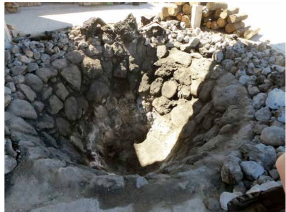
An agave roasting pit, the same design used since Pre-Columbian times