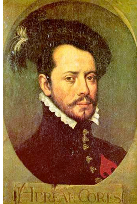
Portrait of Hernán Cortés