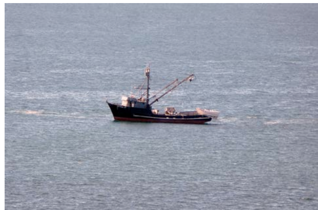
Shrimp boat, working out of Puerto Peñasco, 2013

from the Sea of Cortez makes up about 60% of Mexico's total fishery by dollar value. Industrial ("high seas") shrimpers use one of the most destructive fishing methods known—dragging large trawls across the sea floor, ripping up the top few inches of the sea bed, capturing (and killing) virtually every animal the nets encounter. Limited data suggest that the entire benthic ecosystem of the shallow Gulf has been dramatically altered because of this continual disturbance, year after year, since the 1920s. The principal change appears to be greatly reduced species diversity, loss of rare species, and hypoxia (severe oxygen depletion) due to the rain of decomposing by-catch dumped off the shrimp boats day after day. However, no thorough scientific study of this long-term disturbance has been undertaken. The sardine catch (comprising mainly Sardinops sagax and Opisthonema libertate , and the recently reestablished northern anchovy Engraulis mordax ) is six times the shrimp catch by tonnage, but of relatively less value. Sonora accounts for 60% of Mexico's sardine take. Most of it is processed for poultry feed and fishmeal fertilizer. It is likely that every commercial species in the Sea of Cortez is unsustainably fished today.