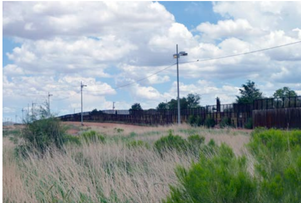
The border fence at Naco, Arizona (looking south from the U.S.)

from Canada into Arizona, New Mexico and Chihuahua until the last decades of the 1500s.