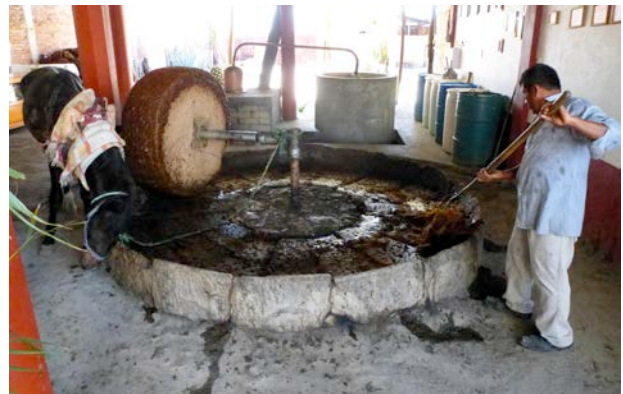
Burro-power drives a stone wheel that grinds roasted agave cabezas into pulp and liquid for subsequent fermentation