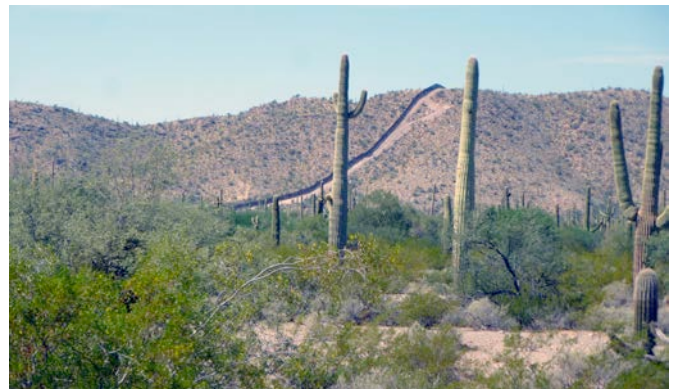
The border fence at Lukeville (AZ)-Sonoyta (SON)

Spanish settlement of Sonora did not occur for nearly a century after Francisco Vázquez de Coronado’s great entrada , much later than in Central and Southern Mexico due to the inclemency of the terrain and conflict with the native peoples of the region. Also, the missionary system of colonialism was distinctive from the rest of Mexico. Early in the 17th Century, the Jesuit Order began to establish missions in northwest Mexico. By the 1640s Spanish lay settlers, mainly miners from central Mexico, had crossed the Sierra Madre Occidental into Sonora. Both forms of settlement were originally restricted to La Serrana , along the river valleys.