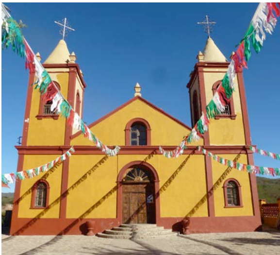
The old mission church at El Triunfo, about an hour south of La Paz (Baja California Sur) was built by the Franciscans in the 1800s. Established as a gold and silver mining town, El Triunfo drew miners from all over the U.S. and Mexico. Once the largest city in B.C.S., it was home to over 10,000 miners in its heyday. Now a remnant of the past, the town's 115 ft-high smokestack was designed by Gustav Eiffel (of Eiffel Tower fame). Today the town has fewer than 500 inhabitants.

Kino's expeditions to the Lower Colorado River and the Sierra Pinacate relied on the springs at Quitobaquito (now part of Organ Pipe Cactus National Monument), as well as other, smaller springs and tinajas that his Indian guides led him to. He made four expeditions into the Pinacates: October 1698, March and April 1701, and November 1706. [Endnote 4]