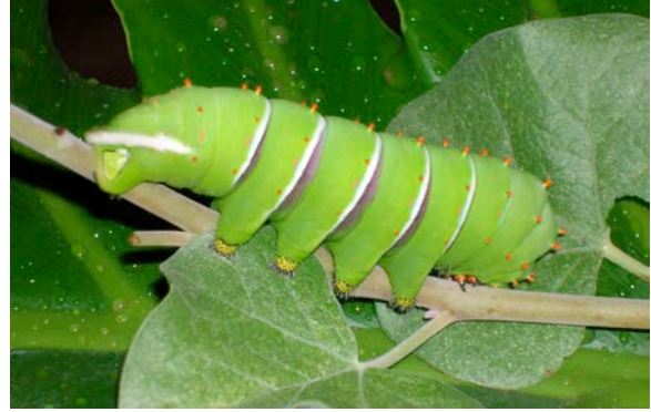
Larva (caterpillar) of the saturniid moth Rothschildia cincta