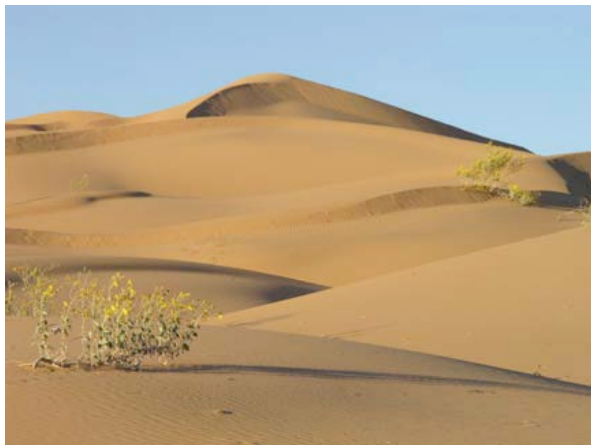
Sand dunes of the Gran Desierto de Altar