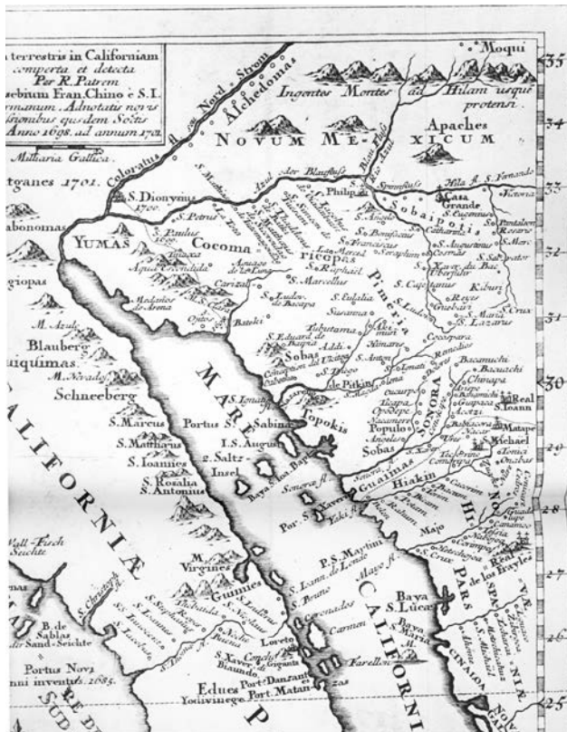
A portion of Kino's famous 1701 map of the Pimeria Alta Region, showing Baja California as a peninsula rather than an island (based on his 9 expeditions between 1698 and 1706).

With the mines came merchants, and the Sierra Madre Occidental foothills town of Hidalgo de Parral (in southern Chihuahua) came to be the merchant center for the region, being strategically positioned between the mining areas of Sonora and central Mexico. Most of the silver ore was packed out to Parral where it was assayed and then shipped to Durango or Mexico