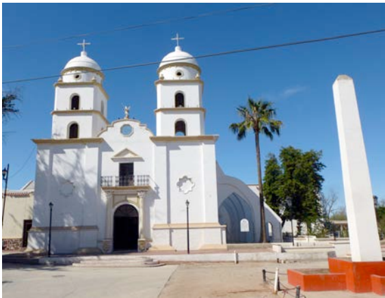
The beautiful Jesuit mission at Ures, along the Río Sonora, built between 1636 and 1644.