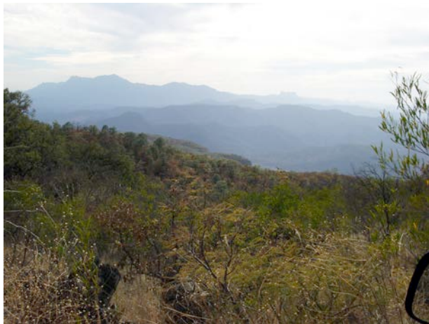
La Serrana, the rugged western slopes of the Sierra Madre Occidental; photo taken east of Álamos (Rancho Santa Barbara)

Geologically, Sonora is underlain by the ancient and massive North American craton, and its dominant rocks were formed 1.2-1.7 billion years ago. Many of the mountain ranges west of the Sierra Madre Occidental and its Sky Islands have been eroded down nearly to their roots, forming isolated rock masses called inselbergs , separated by wide bajadas (flood plains) and basins. Rich deposits of gold dust and nuggets, eroded from the former mountains, have left placers (nuggets and flakes washed downslope through erosional and sedimentary action). The northern part of western Sonora includes the Altar Desert, part of the Lower Colorado River Valley region of the Sonoran Desert and one of