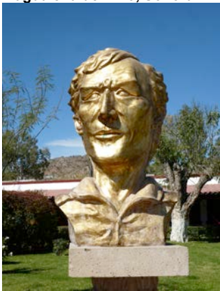
Bust of Padre Kino in the zócalo of Magdalena de Kino, Sonora