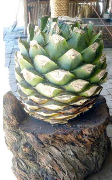
The heart ("cabeza") of an agave, ready for roasting to make mescal