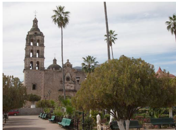
The main zócalo and church at Alamos, Sonora