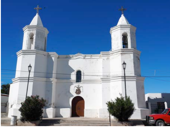
Although the town of Aconchi, Sonora, was founded by the Jesuits in 1639, the modern church dates from the 1700s, was built by the Franciscans, and features a legendary Black Christ.