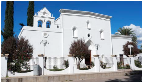
The Jesuit church at Huépac, founded 1639-1644, Iglesia San Lorenzo de Huépac . An original copy of the Mexican Act of Independence from 1810 is said to be protected inside Huépac’s City Hall.

Although the period of initial Spanish conquest of Mexico (sometimes referred to in central Mexico as “The Rape of Mexico”) and the destruction and devastation brought by Hernan Cortés was not felt in Sonora initially, a trip to the old Playa de Cortés Hotel near Guaymas will provide a vivid glimpse of those events. In the bar of this seaside resort are four large, exquisite, and disturbing, bas-relief panels that depict Cortés’s subjugation of the Aztec people. [Endnote 6]