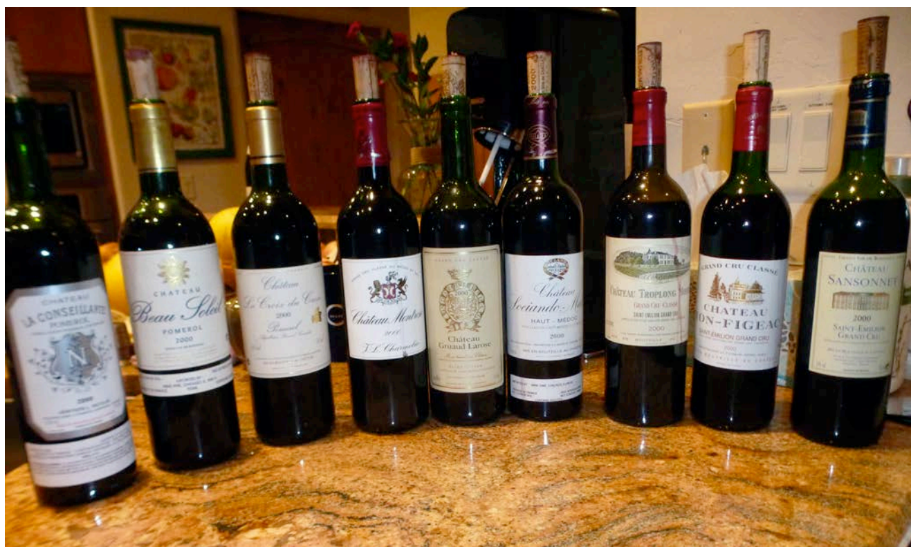
A tasting of 2000 Bordeaux in January 2016. The standout at this tasting was the 2000 Château Troplong-Monot (St. Émilion), 99.5 pts, which can be found online for $110-$150

Left Bank soils are perfect for growing Cabernet Sauvignon grapes because they tend to be fast-draining gravels (Garonne gravel, Pyrenees gravel) and limestone. In much of world, limestone soils (or at least calcareous soils, such as marls and limestone muds) grow some of the best red wine grapes. Limestone soils drain well, preventing the vines from getting too much water, and also precluding root rot. While they drain well in heavy rains, they also have an ability to retain enough water in dry weather to help the vines. Calcareous soils also tend to be alkaline (pH 7-8), which improves nutrient uptake by the roots. Overall, the best wine-growing regions have thin topsoils and subsoils, good drainage, and rich subsoils that the deep roots of wine grapes need. Good wine-growing limestone soils occur throughout much of France, including much of Bordeaux, Champagne, Burgundy, Chablis, Loire, and Southern Rhone. They also occur in much of Tuscany (Italy), and in a crescent of land along the central California coast from the Santa Cruz Mountains (in the north) to Lompoc (in the south), which includes the Paso Robles area (especially the west side of Paso Robles, where some of the finest California wines are beginning to be made).