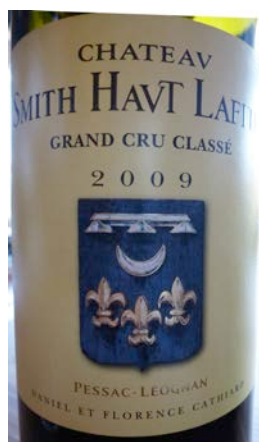
Château Smith Haut Lafitte