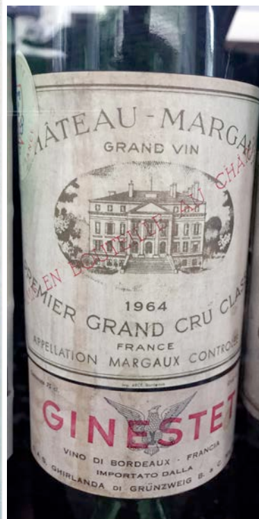
The Principal Bordeaux Appellations

On the Right Bank, west of Saint-Émilion, is the small but prestigious Pomerol appellation. Pomerol produces some of the richest and most complex red wines in Bordeaux (and some of the most expensive wines in the world). These wines are Merlot based, and they are highly regarded for their elegance, richness, and exotic aromas. Some of the best Pomerol's are Vieux Chateau Certan, Chateau Hosanna, Chateau La Violette and Chateau Bon Basteur. These chateaux epitomize both the elegance