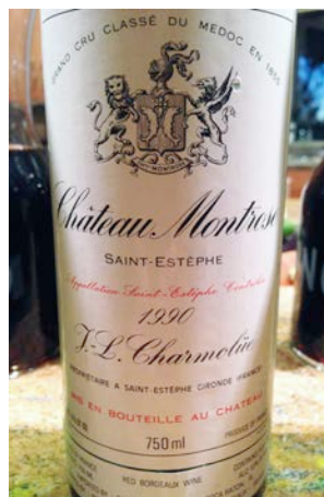
Château Montrose, St.-Estephe