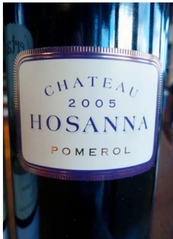
05 Chateau Hosanna