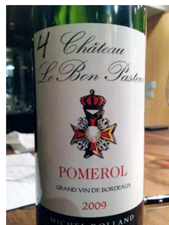
Château Le Bon Pasteur

Chateau Mouton-Rothschild produces 3 vintages in Bordeaux: Le Petit Mouton de Mouton Rothschild, Aile d'Argent, and the famous Châteaux Mouton-Rothschild (in the village of Pauillac, Médoc). For the latter, Baron Philippe de Rothschild long ago came up with the idea of having each year's label designed by a famous artist of the day. In 1946, this became a permanent and significant aspect of the Mouton image with labels created by some of the world's great painters and sculptors. The only exception to date was the unusual gold-enamel bottle for 2000. Artists have included some of the most celebrated of their time, including Miró, Chagall, Braque, Picasso, Francis Bacon, Dali, Jeff Koons, and even Prince Charles (the Prince of Wales). To celebrate the hundredth birthday of the acquisition of Château Mouton, the portrait of Baron Nathaniel de Rothschild appeared on the 1953 label. In 1977, Queen Elizabeth II and the Queen Mother visited the chateau and a special label was designed to commemorate the visit. Some of the Mouton labels are shown below.