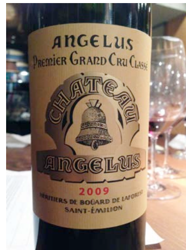
09 Chateau Angelus

The best wine-makers in Bordeaux don't use all their grapes in their top vintages, or grand vins. The grapes they don't use may be imperfect or from younger vines, and these go into their second label wines (same winemaker, same methods). The "second labels" are not necessarily the same thing "Second Growth" (the government-based categories) although they can be. Some great second labels are Pavillon Rouge du Chateau Margaux (from Chateaux Margaux), Les Forts de Latour (from Chateau Latour), Carruades de Lafite (from Chateau Lafite-Rothschild), Le Carillon de l'Angelus (from Chateau Angelus), Le Clarence de Haut-Brion (from Chateau Haut-Brion), and Le Petit Cheval (from Chateau Cheval Blanc, a Saint-Émilion wine and one of only four to be ranked Premier Grand Cru Classé, the Right Bank's highest ranking in its classification system).