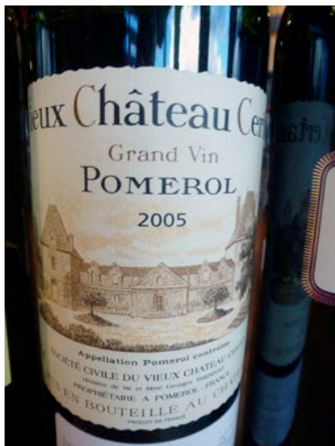
05 Vieux Chateau Certan

and the complexity possible in a Merlot-based wine. These Pomerols are typically blended 80% Merlot, 20% Cabernet Franc. I rated the '05 Vieux Chateau Certan 94 pts, the '05 Hosanna 98.5 pts, the '09 La Violette 96 pts, and the '09 Bon Basteur 94 pts (2014 tastings).