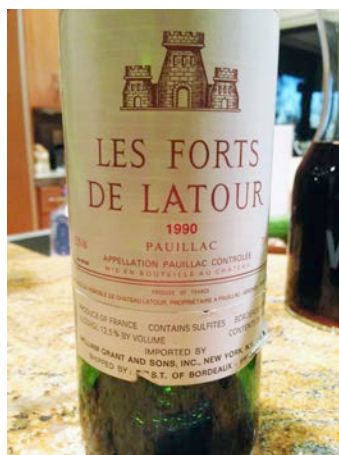
Les Forts de Latour, Château Latour's second wine

1990 & 2009 Château Latour, Les Forts de Latour (Pauillac), $200-$300, 98 pts 1990 Château Montrose (St. Émilion), $125-$200, 96 pts 1992 Château Montrose (St. Émilion), $125-$200, 98 pts 2000 Château Montrose (St. Émilion), $125-$200, 94-99 pts 2000 Château Troplong-Monot (St. Émilion), $110-$150, 95 pts in 2013; 99.5 pts in 2016. 2000 Château Gruaud Larose (St. Julien), $65-$125, 98 pts 2000 Château La Conseillante (Pomerol), $125-$250, 96.5 pts 2003 Château Léoville-Las Cases “Grand Vin de Léoville du Marquis de Las Cases (St. Julien), $150-$400 (98.5 pts) 2005 Château Pape Clément, Grand Cru Classes de Graves, ~$350, 96 pts 2005 Château Branon (Pessac-Léognan, Grand Vin), ~$200 (98.5 pts) 2005 Château Hosanna (Pomerol), ~$300 (98.5 pts) 2009 Château Lascombes (Margaux), ~$120, 96.5 pts 2009 Château la Violette (Pomerol), ~$375, 96 pts 2009 Château Smith Haut Lafitte, Grand Cru Classé (Graves), $700-$950, 98 pts (100 pts by Parker)